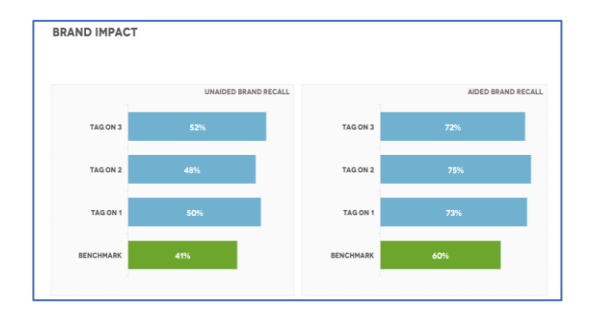
Figure 1: Brand impact above benchmark for all tag-on versions

All three tag-ons were evaluated monadically and in combination with the main TV commercial. All tag-ons increased brand recall and showed added value to the main Tv commercial. However, differences became visible on the activation dimension – the tag-on with a clear call-to-action was most capable to evoke interest and purchase intent.